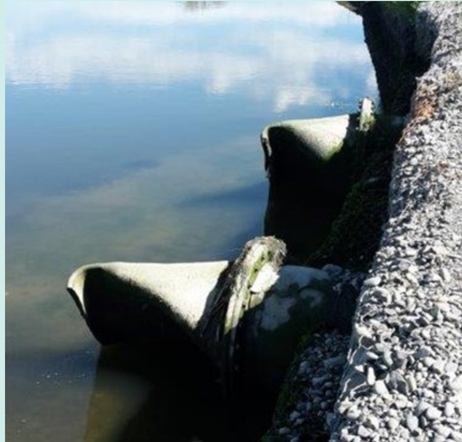
Duckbill valve on a stormwater outlet

Throughout Christchurch we use streets, especially in low-lying areas, as storage areas or secondary flow paths for stormwater when the network is overwhelmed. While street flooding may be a significant inconvenience, it is still preferable to properties flooding.