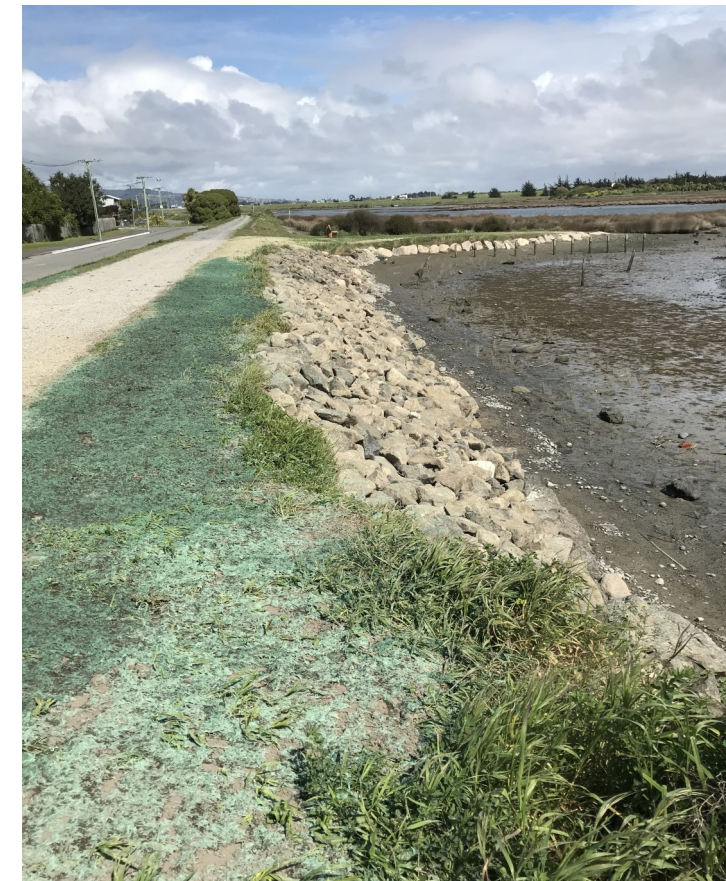
Repaired stopbank at Kibblewhite Street

We've added new rocks and some specialist sea wall 'geofabric' in places along approximately 40 metres of the stopbank on the river side. This work has been added to the base of the stopbank.