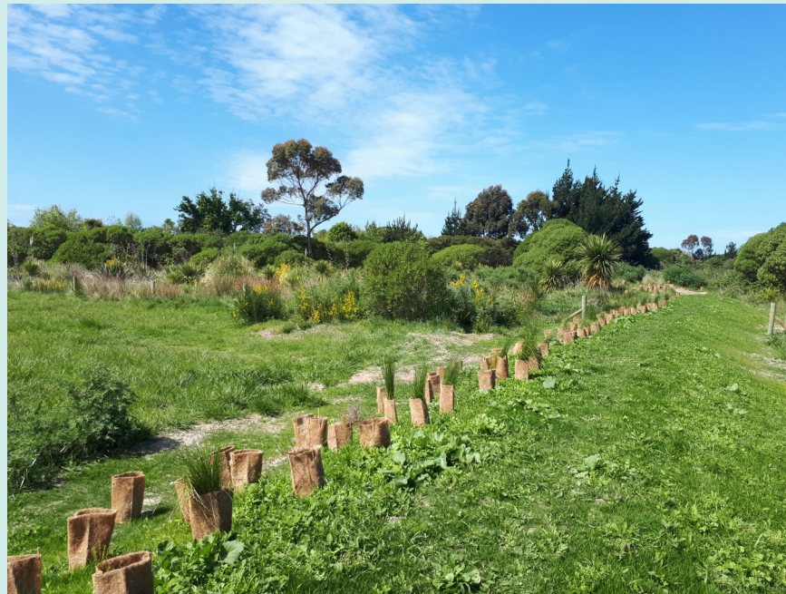
The new stopbank at Bridge Street

We've also completed two temporary pump 'set down' areas at 36A and 62 Rocking Horse Road (in the red zone), to make it easier and faster to install temporary stormwater pumps when required.